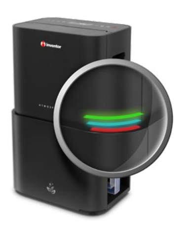
Air Quality Indicator

That way you can achieve ultimate comfort and flexibility of choosing the air direction and acquiring totally balanced conditions in the atmosphere of your place as well as impeccable results at the spot you wish.