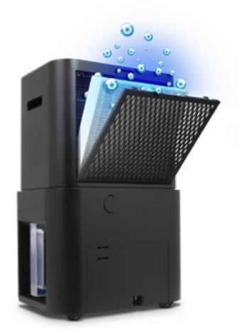
Autonomous Air Purifier Operation