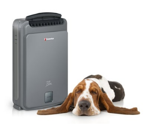
Low Noise Level