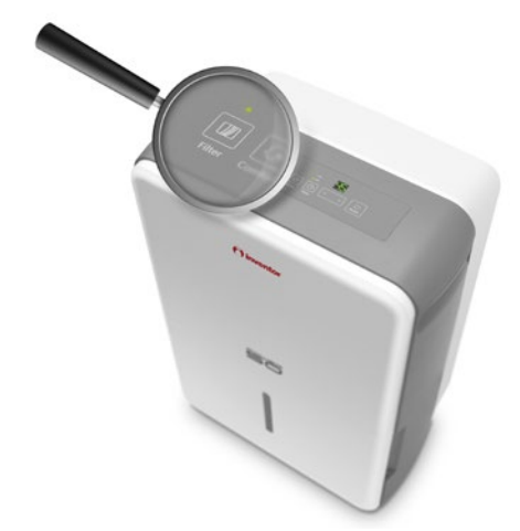
Filter Cleaning Reminder

Smart dehumidification function revolutionizes the economic operation of the dehumidifier with the touch of a single button. Set the dehumidifier to operate in "Smart Dehumidification" and you will be impressed by how readily optimal conditions can be achieved in your area. The dehumidifier automatically selects the desired humidity level between 45% - 55%, always depending on the room temperature, constantly ensuring high quality air with maximum energy savings. Make a «smart» choice and achieve the ultimate relaxing environment.